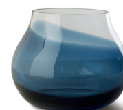
FLOWER VASE NO. 23 RD1021-013 Indigo blue H 18 cm / Ø 23 cm