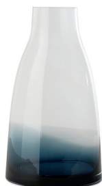
FLOWER VASE NO. 3 RD1002-013 Indigo blue H 34 cm / Ø 19 cm