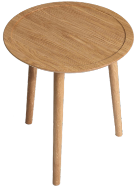
DODONA DOD-CT-Ø46/51OO-720 Oak / Oil H 51 cm / Ø 46 cm