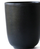
MUG NO. 37 GIFT BOX / RD1123-029 SINGLE PCS. / RD1124-029 Lava stone H 10.5 cm / Ø 8.5 cm