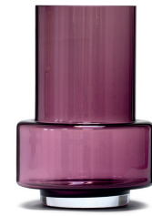
HURRICANE NO. 26 RD1034-024 Heather H 25 cm / Ø 17 cm