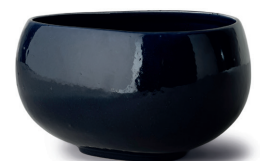
BOWL NO. 9 RD1008-014 Ultramarine H 13 cm / Ø 23 cm