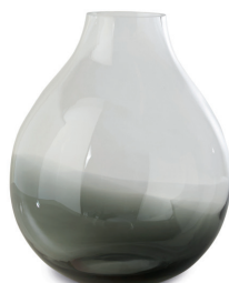
FLOWER VASE NO. 24 RG1002-004 Smoked grey H 40 cm / Ø 34 cm