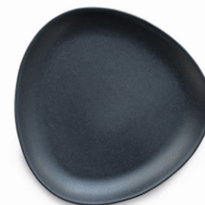
PLATE NO. 34 GIFT BOX / RD1117-029 SINGLE PCS. / RD1118-029 Lava stone H 2.2 cm / Ø 23 cm