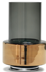
HURRICANE NO. 26 RD1035-005 Smoked grey + gold H 25 cm / Ø 17 cm