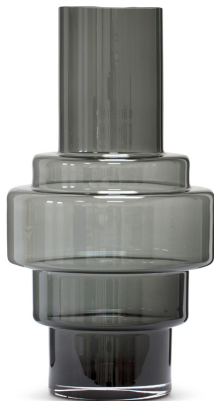
HURRICANE NO. 45 RD1073-004 Smoked grey H 46 cm / Ø 25 cm