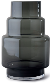
HURRICANE NO. 69 RD1138-004 Smoked grey H 31 cm / Ø 20 cm