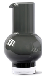
CARAFE NO. 49 RD1086-004 Smoked grey H 23 cm / Ø 13.5 cm (1.1 l)