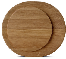
OAK BOARD SMALL NO. 61 RD1130-020 Nature H 2.5 cm / L 30 cm / W 26 cm