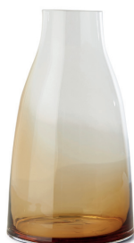
FLOWER VASE NO. 3 RD1002-016 Burnt sienna H 34 cm / Ø 19 cm