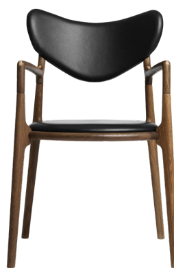
SALON CHAIR SAL-C-OSML2-991 Oak / Smoked, upholstered Exclusive Leather / Sydney / Black H 88 cm / W 58.1 cm D 43.4 cm / SH 47 cm