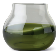
FLOWER VASE NO. 23 RD1021-034 Moss green H 18 cm / Ø 23 cm