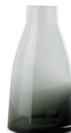
FLOWER VASE NO. 3 RD1002-004 Smoked grey H 34 cm / Ø 19 cm