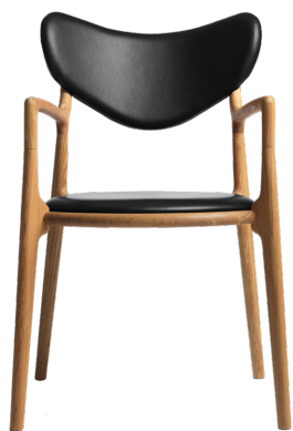
SALON CHAIR SAL-C-OOL2-991 Oak / Oil, upholstered Exclusive Leather / Sydney / Black H 88 cm / W 58.1 cm D 43.4 cm / SH 47 cm