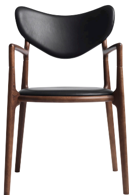
SALON CHAIR SAL-C-BBRL1-990 Beech / Walnut stained, upholstered Standard Leather / Sierra / Black H 88 cm / W 58.1 cm D 43.4 cm / SH 47 cm