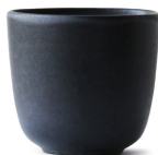
CUP NO. 36 GIFT BOX / RD1121-029 SINGLE PCS. / RD1122-029 Lava stone H 8 cm / Ø 8.5 cm