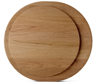
OAK BOARD GOURMET NO. 64 RD1133-020 Nature H 2.5 cm / L 45 cm / W 41 cm