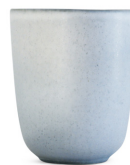
MUG NO. 37 GIFT BOX / RD1123-002 SINGLE PCS. / RD1124-002 Ash grey H 10.5 cm / Ø 8.5 cm