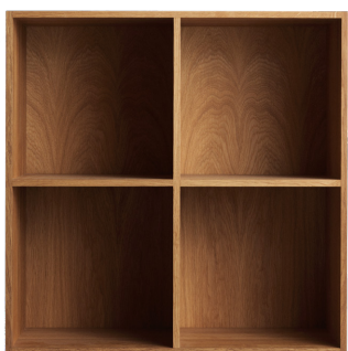
PANTRY PTY-ST4K/26-OO-720 Oak / Oil H 70.5 cm / W 70.5 cm / D 26 cm