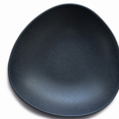
DEEP PLATE NO. 52 GIFT BOX / RD1113-029 SINGLE PCS. / RD1114-029 Lava stone H 5 cm / Ø 21 cm