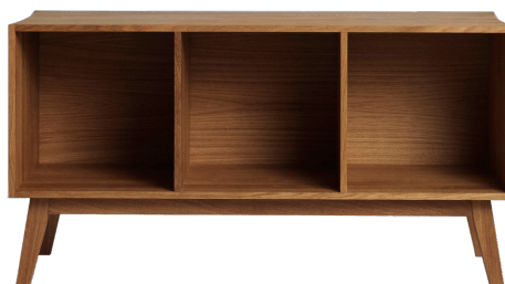
PANTRY PTY-ST3H/36-OO-720 Oak / Oil H 36 cm / W 105 cm / D 36 cm PANTRY LEG BASE PTY-LF3/36-OO-720 Oak / Oil H 19.5 cm / W 105 cm / D 36 cm