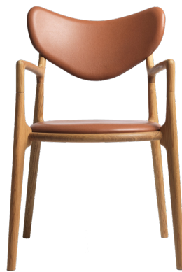
SALON CHAIR SAL-C-OOL1-620 Oak / Oil, upholstered Standard Leather / Sierra / Calvados H 88 cm / W 58.1 cm D 43.4 cm / SH 47 cm