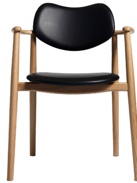
REGATTA CHAIR REG-C-OOL1/L1-990

Oak / Oil, unupholstered H 77.7 cm / W 59.6 cm D 53.8 cm / SH 44.5 cm