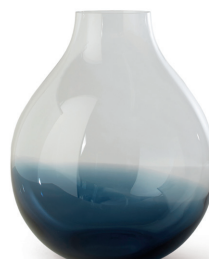
FLOWER VASE NO. 24 RG1002-013 Indigo blue H 40 cm / Ø 34 cm