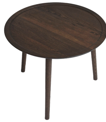
DODONA DOD-CT-Ø60/46OSM-730 Oak / Smoked H 46 cm / Ø 60 cm