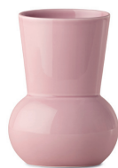
OVAL VASE NO. 66, WIDE RD1135-031 Rose pink H 22 cm / W 15.5 cm / D 12 cm