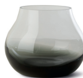
FLOWER VASE NO. 23 RD1021-004 Smoked grey H 18 cm / Ø 23 cm