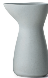
JUG NO. 58 RD1127-002 Ash grey H 22 cm / W 11 cm / L 14 cm (1)