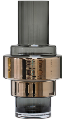
HURRICANE NO. 45 RD1074-006 Smoked grey + platinum H 46 cm / Ø 25 cm