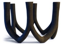
LIGHT PIECE NO. 22 RG1001-030 Dark raw H 18.5 cm / Ø 27 cm