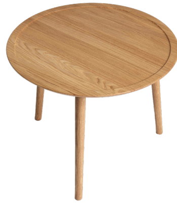
DODONA DOD-CT-Ø60/46OO-720 Oak / Oil H 46 cm / Ø 60 cm