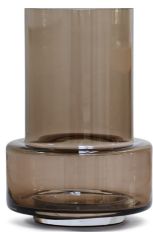
HURRICANE NO. 26 RD1034-028 Sepia brown H 25 cm / Ø 17 cm