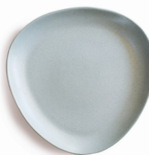
PLATE NO. 34 GIFT BOX / RD1117-002 SINGLE PCS. / RD1118-002 Ash grey H 2.2 cm / Ø 23 cm