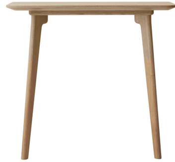
SALON CONSOLE TABLE SAL-CT-85/35OS-710 Oak / Soaped H 74 cm / L 85 cm / W 35 cm