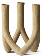
LIGHT PIECE NO. 21 RG1000-026 Raw H 18.5 cm / Ø 13.5 cm