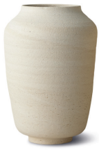
HAND TURNED VASE CLASSIC NO. 59 RD1128-033 Vanilla H 22 cm / Ø 15 cm