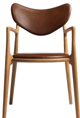
SALON CHAIR SAL-C-OOL3-640 Oak / Oil, upholstered Supreme Leather / Vacona / Cognac H 88 cm / W 58.1 cm D 43.4 cm / SH 47 cm