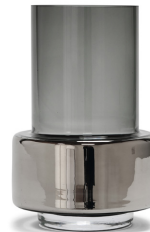
HURRICANE NO. 26 RD1035-006 Smoked grey + platinum H 25 cm / Ø 17 cm