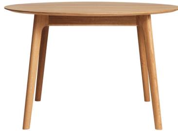
SALON EXTENSION TABLE - ROUND SAL-ET-Ø12000-720 Oak / Oil H 74 cm / Ø 120 - 220 cm