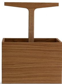
TOOLBOX HIGH RD1141-020 Nature H 39 cm / L 29 cm / W 23 cm