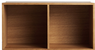
PANTRY PTY-ST2H/26-OO-720 Oak / Oil H 36 cm / W 70.5 cm / D 26 cm