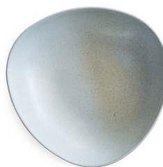
DEEP PLATE NO. 52 GIFT BOX / RD1113-002 SINGLE PCS. / RD1114-002 Ash grey H 5 cm / Ø 21 cm