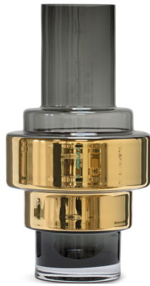
HURRICANE NO. 45 RD1074-005 Smoked grey + gold H 46 cm / Ø 25 cm