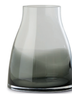
FLOWER VASE NO. 2 RD1001-004 Smoked grey H 18 cm / Ø 15 cm