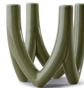
CHANDELIER NO. 56 RD1125-035 Olive green H 17 cm / W 14 cm / D 14 cm