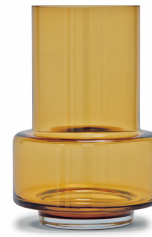
HURRICANE NO. 26 RD1034-015 Amber H 25 cm / Ø 17 cm