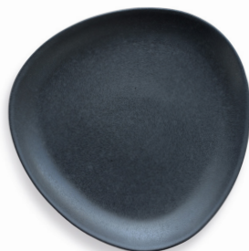
PLATE NO. 35 GIFT BOX / RD1119-029 SINGLE PCS. / RD1120-029 Lava stone H 2.4 cm / Ø 27 cm