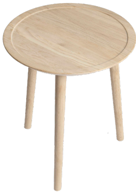
DODONA DOD-CT-Ø46/51OS-710 Oak / Soaped H 51 cm / Ø 46 cm