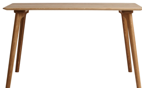
SALON TABLE SAL-WD-131/75OO-720 Oak / Oil H 74 cm / L 131 cm / W 75 cm