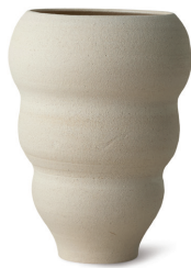
HAND TURNED VASE CURVED NO. 60 RD1129-033 Vanilla H 25 cm / Ø 16.5 cm