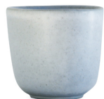
CUP NO. 36 GIFT BOX / RD1121-002 SINGLE PCS. / RD1122-002 Ash grey H 8 cm / Ø 8.5 cm