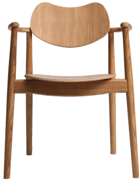
REGATTA CHAIR REG-C-OO-720

Oak / Oil, unupholstered H 77.7 cm / W 59.6 cm D 53.8 cm / SH 44.5 cm