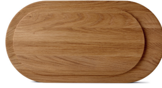
OAK BOARD LARGE NO. 63 RD1132-020 Nature H 2.5 cm / L 51 cm / W 26 cm