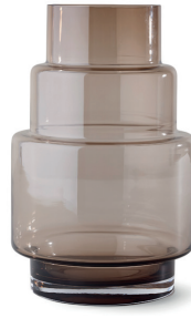
HURRICANE NO. 69 RD1138-028 Sepia brown H 31 cm / Ø 20 cm