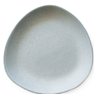
PLATE NO. 33 GIFT BOX / RD1115-002 SINGLE PCS. / RD1116-002 Ash grey H 2 cm / Ø 18 cm