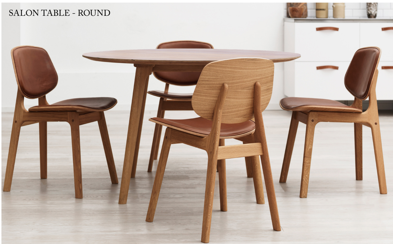
SALON TABLE - ROUND