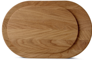
OAK BOARD MEDIUM NO. 62 RD1131-020 Nature H 2.5 cm / L 41 cm / W 26 cm