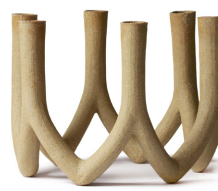
LIGHT PIECE NO. 22 RG1001-026 Raw H 18.5 cm / Ø 27 cm