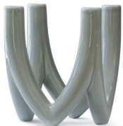
CHANDELIER NO. 56 RD1125-032 Moon stone H 17 cm / W 14 cm / D 14 cm