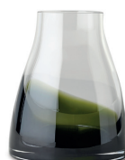
FLOWER VASE NO. 2 RD1001-034 Moss green H 18 cm / Ø 15 cm