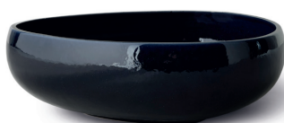
BOWL NO. 10 RD1009-014 Ultramarine H 10 cm / Ø 31 cm