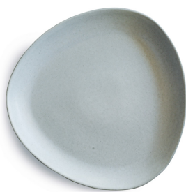
PLATE NO. 35 GIFT BOX / RD1119-002 SINGLE PCS. / RD1120-002 Ash grey H 2.4 cm / Ø 27 cm