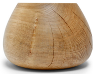
OAK PIECE NO. 30 RG1003-020 Nature H 15 cm / Ø 22 cm