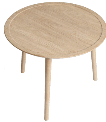
DODONA DOD-CT-Ø60/46OS-710 Oak / Soaped H 46 cm / Ø 60 cm