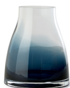
FLOWER VASE NO. 2 RD1001-013 Indigo blue H 18 cm / Ø 15 cm