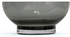
GLASS BOWL NO. 51 RD1097-004 Smoked grey H 11 cm / Ø 24 cm