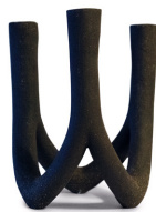
LIGHT PIECE NO. 21 RG1000-030 Dark raw H 18.5 cm / Ø 13.5 cm