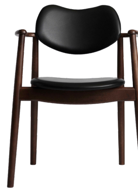
REGATTA CHAIR REG-C-BBRL1/L1-990

Oak / Oil, upholstered Seat and Back Supreme Leather / Vacona / Cognac H 77.7 cm / W 59.6 cm D 53.8 cm / SH 44.5 cm