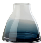
FLOWER VASE NO. 1 RD1000-013 Indigo blue H 12 cm / Ø 13 cm