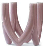
CHANDELIER NO. 56 RD1125-031 Rose pink H 17 cm / W 14 cm / D 14 cm