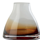
FLOWER VASE NO. 1 RD1000-016 Burnt sienna H 12 cm / Ø 13 cm