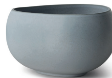
BOWL NO. 9 RD1008-002 Ash grey H 13 cm / Ø 23 cm