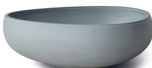
BOWL NO. 10 RD1009-002 Ash grey H 10 cm / Ø 31 cm