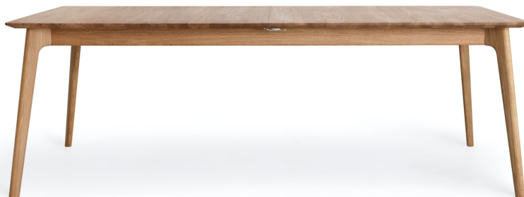
SALON EXTENSION TABLE SAL-ET-220/10000-720 Oak / Oil H 74 cm / L 220 - 320 cm / W 100 cm