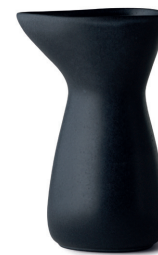
JUG NO. 58 RD1127-029 Lava stone H 22 cm / W 11 cm / L 14 cm (1)