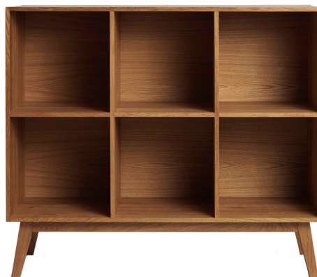
PANTRY PTY-ST6H/36-OO-720 Oak / Oil H 70.5 cm / W 105 cm / D 36 cm PANTRY LEG BASE PTY-LF3/36-OO-720 Oak / Oil H 19.5 cm / W 105 cm / D 36 cm