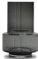
HURRICANE NO. 26 RD1034-004 Smoked grey H 25 cm / Ø 17 cm