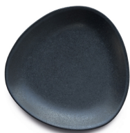
PLATE NO. 33 GIFT BOX / RD1115-029 SINGLE PCS. / RD1116-029 Lava stone H 2 cm / Ø 18 cm