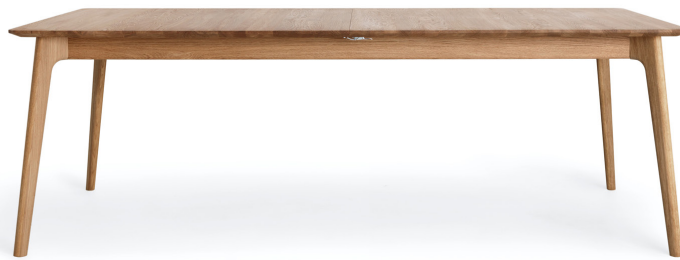
SALON EXTENSION TABLE SAL-ET-190/9000-720 Oak / Oil H 74 cm / L 190 - 290 cm / W 90 cm