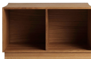
PANTRY PTY-ST2H/36-OO-720 Oak / Oil H 36 cm / W 70.5 cm / D 26 cm PANTRY HIGH BASE PTY-BH-OO-720 Oak / Oil H 7 cm / W 69 cm / D 36 cm