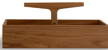
TOOLBOX LOW RD1140-020 Nature H 19 cm / L 46 cm / W 23 cm