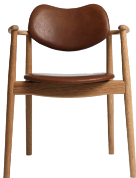
REGATTA CHAIR REG-C-OOL3/L3-640

Oak / Oil, upholstered Seat and Back Standard Leather / Sierra / Black H 77.7 cm / W 59.6 cm D 53.8 cm / SH 44.5 cm