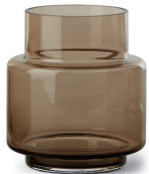
HURRICANE NO. 53 RD1106-028 Sepia brown H 15 cm / Ø 12 cm