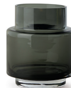
HURRICANE NO. 53 RD1106-004 Smoked grey H 15 cm / Ø 12 cm