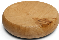
OAK PIECE NO. 32 RG1005-020 Nature H 7 cm / Ø 29 cm