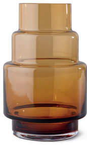
HURRICANE NO. 69 RD1138-015 Amber H 31 cm / Ø 20 cm