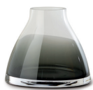
FLOWER VASE NO. 1 RD1000-004 Smoked grey H 12 cm / Ø 13 cm