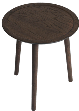
DODONA DOD-CT-Ø46/51OSM-730 Oak / Smoked H 51 cm / Ø 46 cm