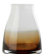
FLOWER VASE NO. 2 RD1001-016 Burnt sienna H 18 cm / Ø 15 cm