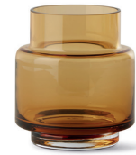
HURRICANE NO. 53 RD1106-015 Amber H 15 cm / Ø 12 cm