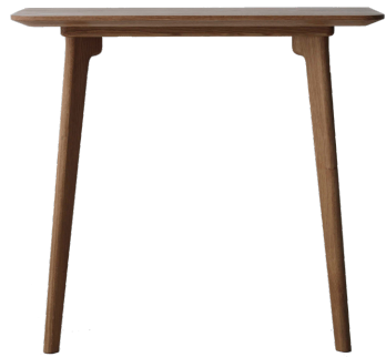
SALON CONSOLE TABLE SAL-CT-85/35OSM-730 Oak / Smoked H 74 cm / L 85 cm / W 35 cm